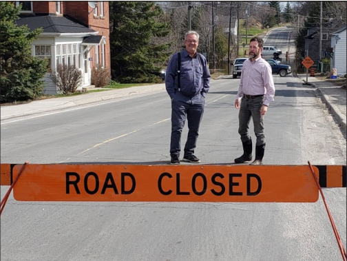
LANARK VILLAGE Visiting flooded homes and businesses

This report outlines the money spent by my office during the 2018/19 fiscal year (ending March 31, 2019). It compares my total to the average expenses of all MPs, and provides my ranking amongst all 338 MPs.