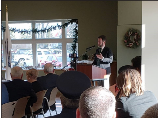
GLENBURNIE Inaugural meeting of Frontenac County Council