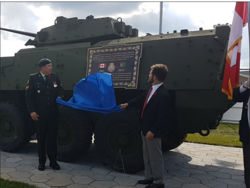
SMITHS FALLS Honouring our Afghanistan veterans