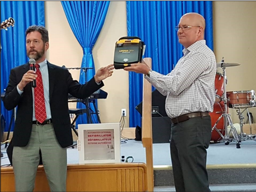
VERONA Installing an AED at the Free Methodist Church