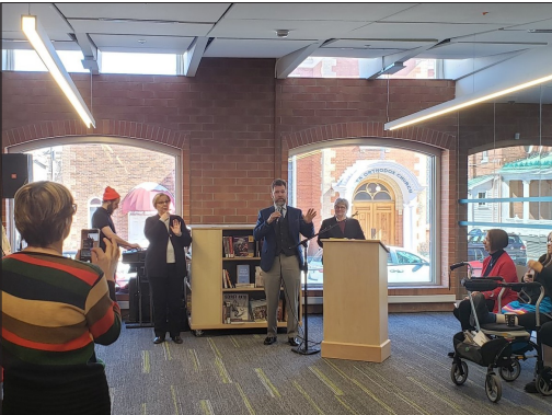
KINGSTON Re-opening the Kingston Frontenac Public Library