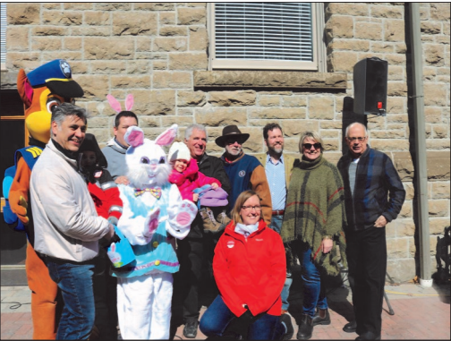
CARLETON PLACE People First Bunny Run