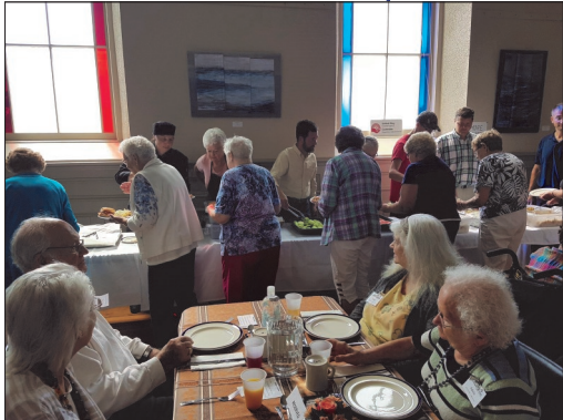
SYDENHAM South Frontenac Community Services BBQ