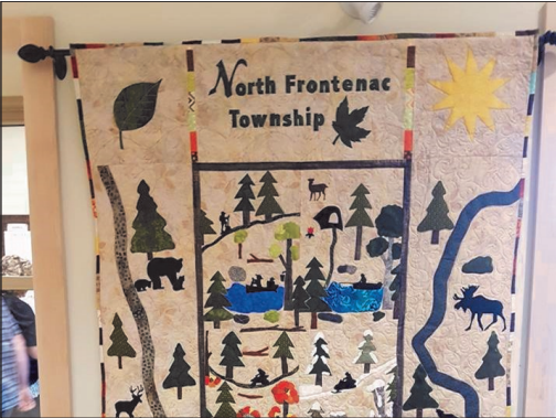
PLEVNA North Frontenac Municipal Complex Open House