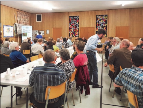
ELGINBURGH Frontenac Federation of Agriculture AGM