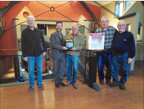
SMITHS FALLS Delivering an AED to Station Theater