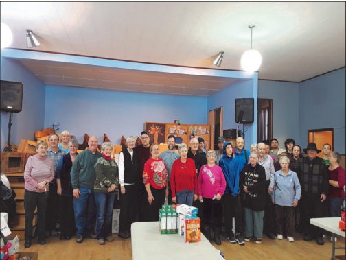
LANARK Christmas baskets at St. Andrew's Church