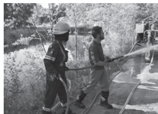
CENTRAL FRONTENAC Practice session with Parham Station, Central Frontenac Fire Department

Some activities I've attended around our constituency. — Scott R.