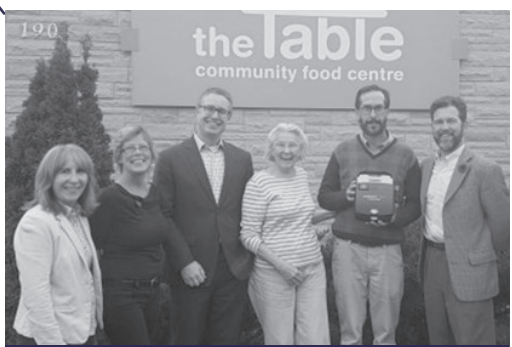
PERTH Donating a defibrillator at The Table