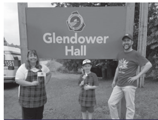
SOUTH FRONTENAC Canada Day