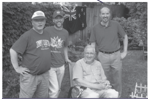
KINGSTON Burying a time capsule for Canada's 150th