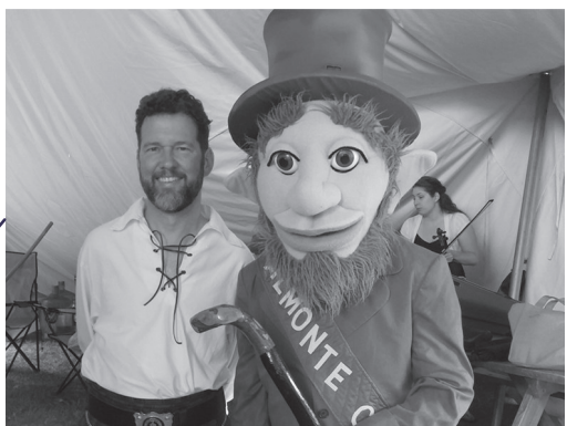
ALMONTE 21st Annual Celtfest