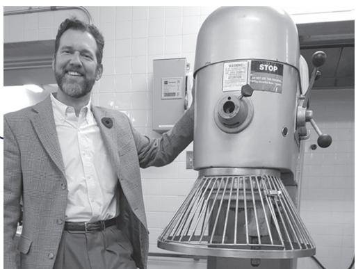
SMITHS FALLS Two Rivers Food Hub