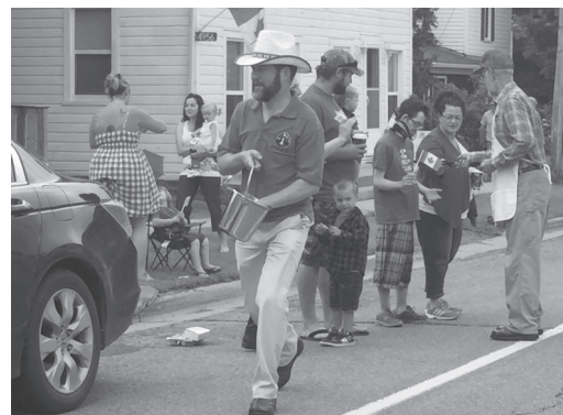
HARROWSMITH Canada Day Parade