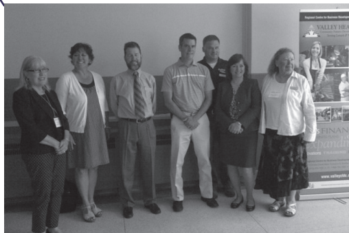
SMITHS FALLS Valley Heartland Community Futures Development Corporation AGM