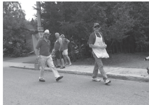
SYDENHAM Canada Day Parade