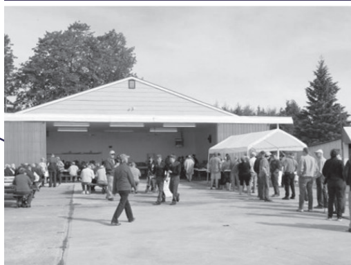
MONTAGUE Flying Club Fly-In Breakfast