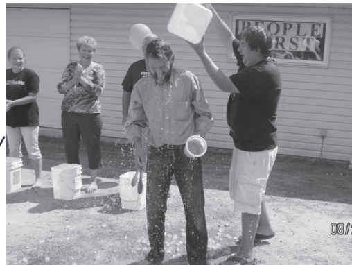
CARLETON PLACE "Ice Bucket Challenge" Fundraiser for A.L.S. Research