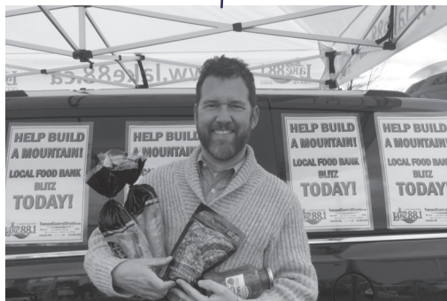
Perth "Build a Mountain of Food" Drive