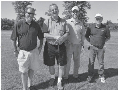
PERTH Golfing for Big Brothers Big Sisters of Lanark