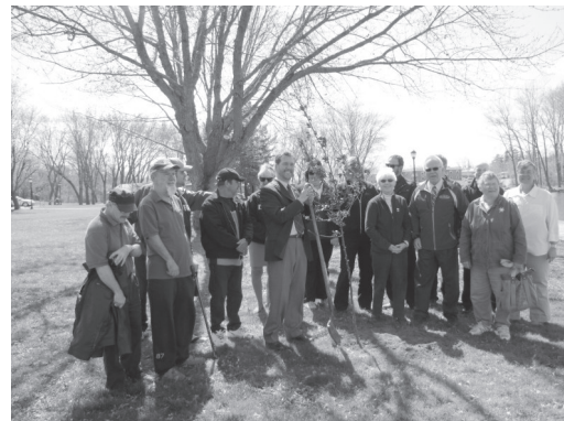
NAPANEE Tree planting on Earth Day.