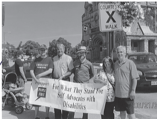
CARLETON PLACE People First Walk-a-thon.