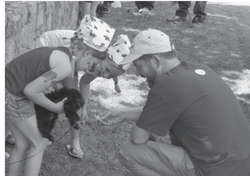
TAMWORTH Canada Day Parade.