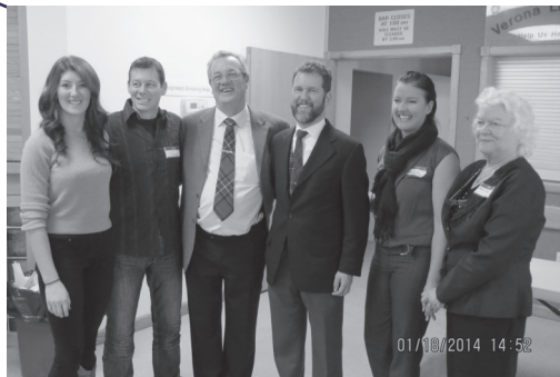
VERONA 2014 Verona Levee.

This report outlines the money spent by the office of Scott Reid during the most recently-published fiscal year (ending March 31, 2014). It compares Scott's total to the average expenses per MP, and provides Scott's ranking amongst all 308 MPs.