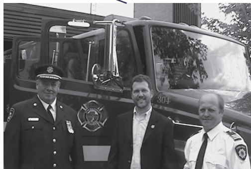
NEWBURGH Fire Department's 65th Anniversary.