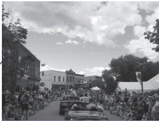
ALMONTE Puppets Up! Parade