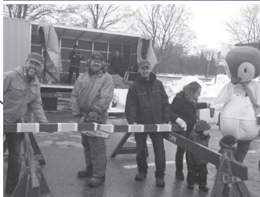
CARLETON PLACE Winter Festival 2016