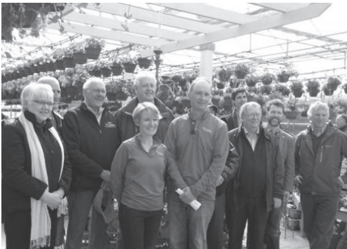
SOUTH FRONTENAC Rural Economy Tour 2016

Around the Riding: Some activities from around our constituency. — Scott R.