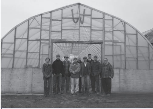
KINGSTON Touring farms in north Kingston