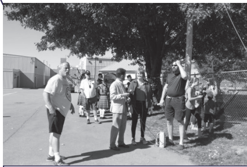
SMITHS FALLS Urban Jungle