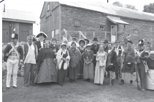
Perth Heritage Days 200th Anniversary of the Perth Military Settlement